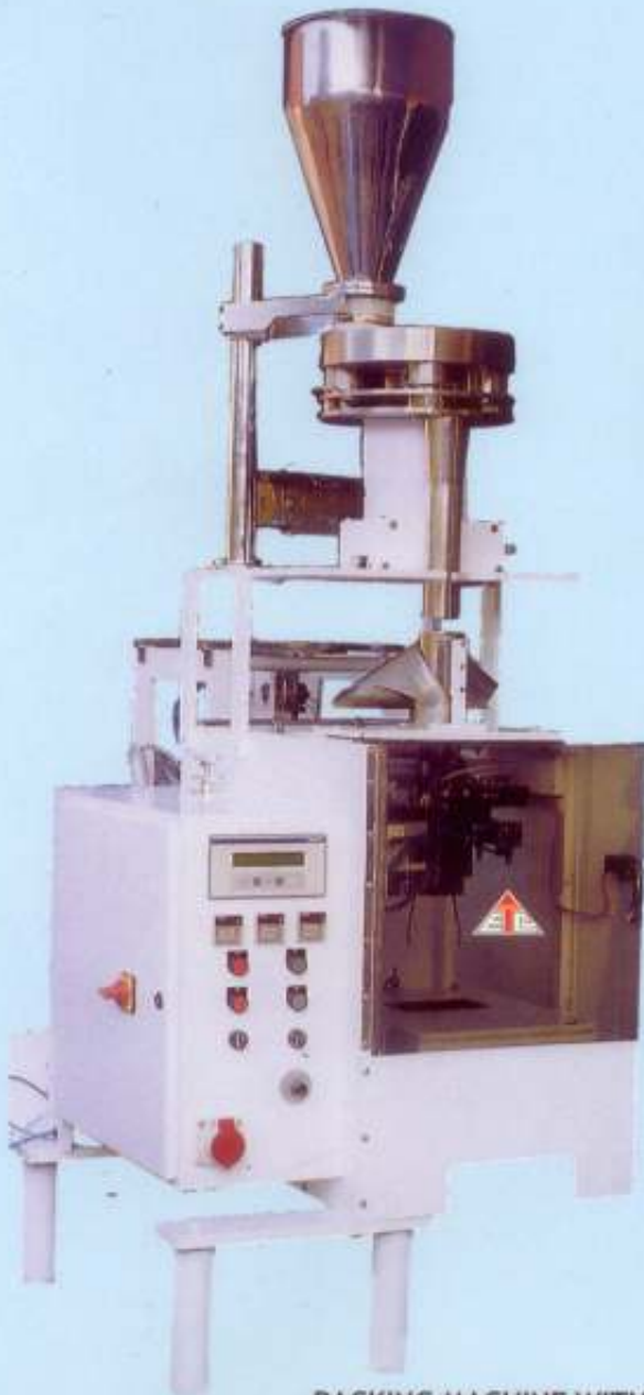
PACKING MACHINE WITH VOLUMETRIC CUP FILLING SYSTEMS

Ex: Tea, Rice, Pulses, Snack Food, Dry Fruits, Sugar, Peanuts, Namkeen etc.